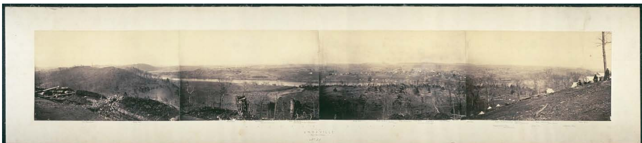
Historic View of Knoxville from Fort Stanley