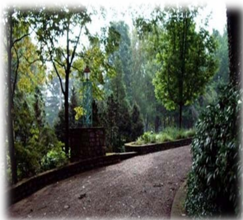
The Knoxville Botanical Garden & Arboretum