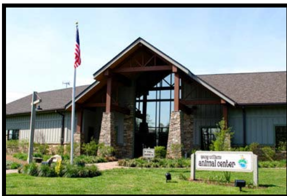
Young-Williams Animal Center

In addition, the Aslan Foundation responds to a limited number of requests for Knoxville-based educational, social welfare and cultural grant support. Developing innovative efforts in these areas, particularly education, will be a priority for the Foundation in the coming years.