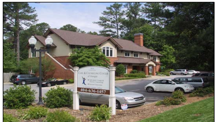
Care and Counseling Center of Georgia headquarters

The new Executive Director will have organizational strengths to leverage –