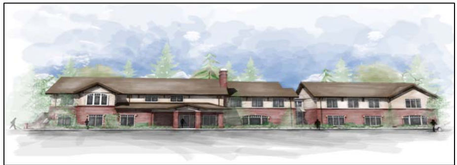
Drawing of CCCG's future expanded headquarters

CCCG is widely recognized for clinical excellence and innovation. The Center is an affiliate of the Samaritan Institute, a national network of counseling centers whose mission is supporting team-oriented, cost-efficient counseling, education and consultation that emphasizes interrelatedness of mind, body, spirit, and community. The organization provides services at its main center and at multiple locations throughout metro Atlanta, through partner churches, seminaries, nonprofits and medical institutions.