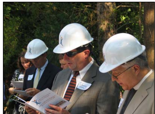
The dedication ceremony for the new CCCG facility

The new Executive Director will bring a track record of successful leadership, management, growth and diversification of revenues and funding sources. She